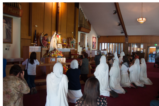
Prayer Warriors. Our Lady of Peace Shrine at the heart of Silicon Valley in San Francisco Bay Area in California.