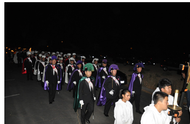
Grand procession with the Knights of Columbus in full regalia. More than thirty members of the K of C served as honor guards in Fremont, CA.