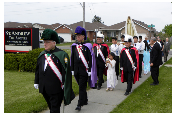
Our Lady is welcomed in Ontario Diocese in Canada.

Physical cures attributed to the presence of the Statue have been documented many times. The changes in expression and coloration, and even the pose of the statue have been reported innumerable times. But, the important miracles are the spiritual cures and gifts Our Lady bestows. The sudden conversion of a stubborn heretic is a good example. The spiritual miracles are infinitely more valuable than the things we can see, touch or measure.