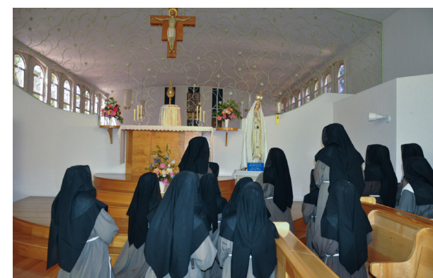
Cloistered Sisters of Poor Clare of the Immaculate Heart in Palo Alto, CA. They requested not to show their faces but their hearts showed their love for Mary.