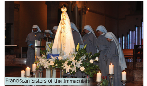
Franciscan Sisters of the Immaculate