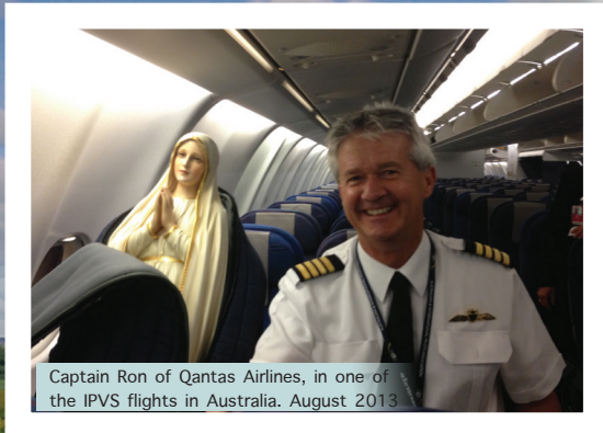
Captain Ron of Qantas Airlines, in one of the IPVS flights in Australia. August 2013