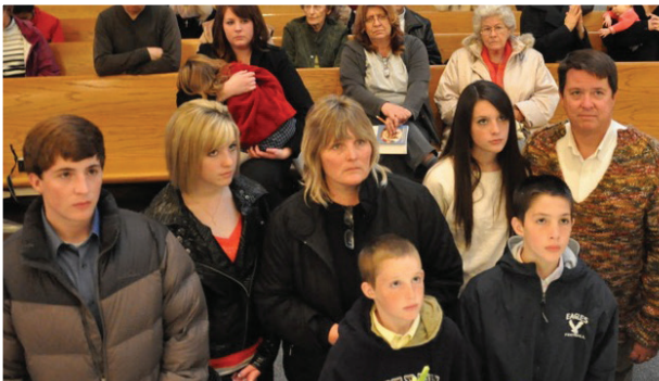
The Murphy Family in 2009