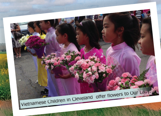
Vietnamese Children in Cleveland offer flowers to Our Lady