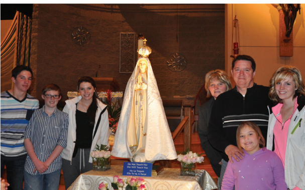
The Murphy Family in 2013