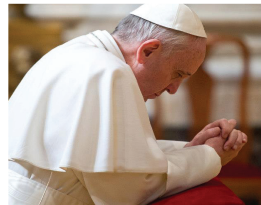
Pope Francis' first outing was to kneel in prayer in front of the icon of the Virgin Mary in St. Mary Major Basilica in Rome, this was several hours after his election to the papacy.

"Let us ask Mary to help us to respond to violence, to conflict and to war, with the power of dialogue, reconciliation and love. She is our mother: may she help us to find peace; all of us are her children! Help us, Mary, to overcome this most difficult moment and to dedicate ourselves each day to building in every situation an authentic culture of encounter and peace. Mary, Queen of Peace, pray for us!"