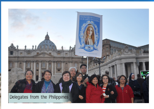
Delegates from the Philippines