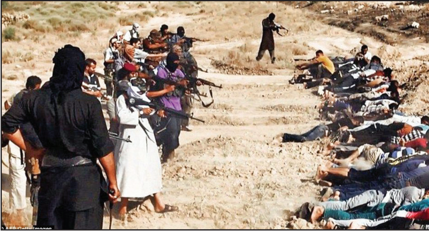
Firing squad: Amassed jihadists appear to be just about to open fire on the bodies who are arranged in a shallow ditch.

It's true, people are being martyred, killed because they are Christians, right now, this year. We are uncomfortable thinking of it. We want to relegate martyrdom to the times centuries ago. But, the truth is, we have perhaps 100's of new martyrs just this year. Often our news media tries to hide or ignore the religious aspect of the carnage in the Mid-East and Africa.