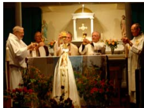
THE GREAT DOXOLOGY. “THROUGH HIM WITH HIM, IN HIM..”

“...with the rosary in my hands, the name of Mary on my lips, and the canticle of mercy in my heart”