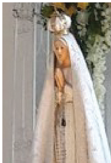
clear Age, The Memoirs of Sr. Lucia, The 101 Foundation, Asbury, NJ, 1993.