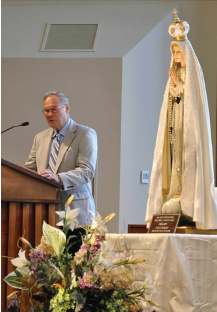
Custodian of the International Pilgrim Virgin Statue of Our Lady of Fatima

Located at the Pilgrim Virgin Foundation in Munster, IN – Email: LayApostle@aol.com