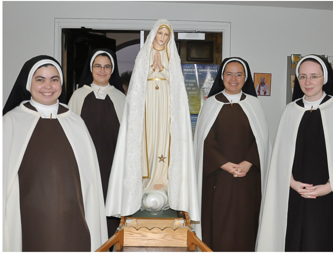
Carmelite Sisters, DCJ

Dedicating their lives in daily servanthood. The Carmelite Sisters of the Divine Heart of Jesus is a First Order Carmelite congregation of sisters that combine a contemplative life with a rich apostolate in serving elderly, youth, and children. Over the years they have become "friends of Our Lady" in the IPVS Apostolate by their constant prayers and allowing their members to actively host and take part in the travels of Our Blessed Mother.