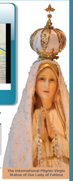
The International Pilgrim Virgin Statue of Our Lady of Fatima

Pray the Rosary, NOW Online. Join others from around the world. www.pilgrimvirginstatue.com