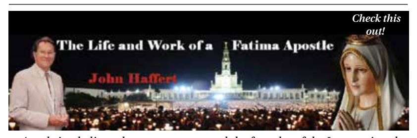
A website dedicated to a great man and the founder of the International Pilgrim Virgin Statue Foundation.

So, let us ask the Blessed Virgin Mother, Mary, the Immaculate Conception, to intercede for our country; to bring forth a relief from this virus, for us to return to the beliefs and moral values that our forefathers lived and to whom they consecrated us. "O, Mary conceived without sin, pray for us who have recourse to thee."