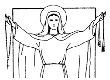
Our Lady's Greatest Gift

Pope Pius XI called the Sabbatine Privilege "Our greatest privilege from the Mother of God which extends even after death ..."